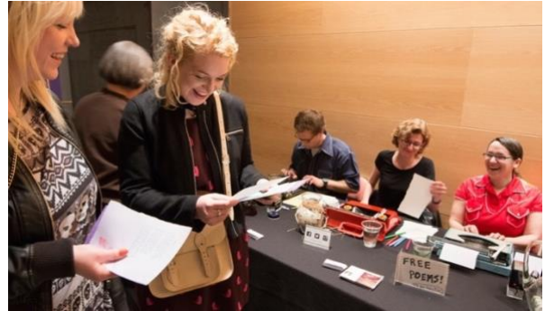
Harry Ransom Center, Austin

Give a topic, get a poem. For over a decade, Austin-based Typewriter Rodeo has traveled all across Texas and the U.S. creating custom, on-demand poems for events guests. From a Hilton grand opening party at Cabo San Lucas, to a Smithsonian museum exhibit in Washington, D.C., the Rodeo poets sit behind their vintage typewriters, take topic requests, and churn out instant, personalized poems.