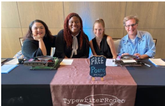
SAFE Austin fundraiser

"Not just entertainment: a personal, emotional keepsake for each employee." - PayPal